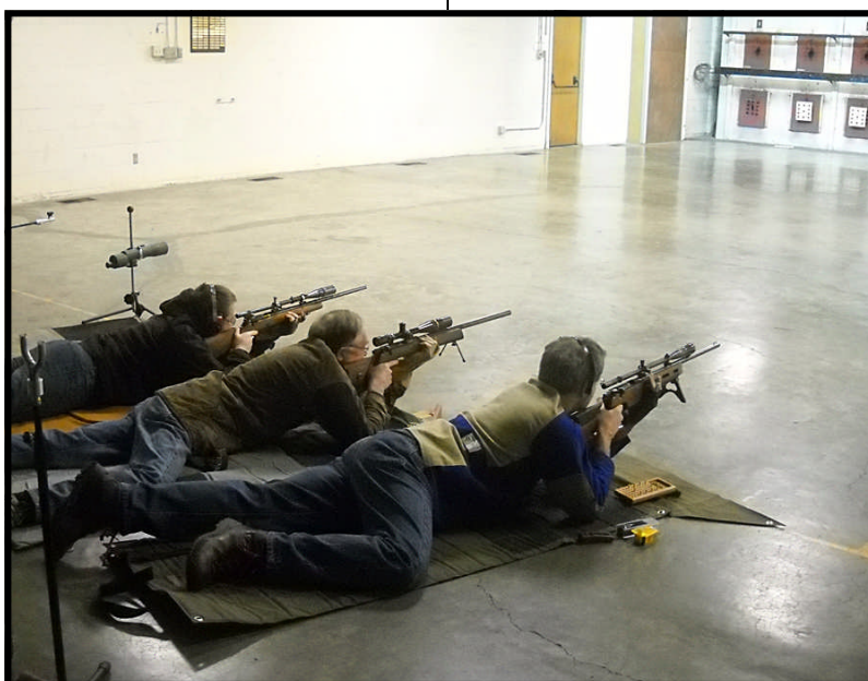
Wild Mink team firing prone in league, February 2011